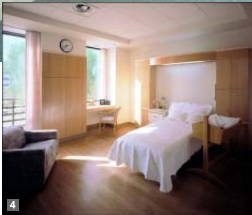
South Wing and Cancer Center, Mt. Diablo Medical Center Concord, California Architect: Anshen+Allen Architects, 1994

high CRI lamps supply illumination of objects in a close to the measure of the whiteness of light produced by a given lamp. Color temperature is measured in Kelvin degrees. For example, a candle flame has a color temperature of about 2000K, incandescent lamp 2700K and white halogen lamps typically have a color temperature of 2900K (Steffy, 2002). The significance of these terms in the studies of biological effects of light is evident because light affords us the visualization and rendition of color. The subject deserves to be treated in greater depth, but that goes beyond the purpose of this monograph. More information about color vision can be found in Human Color Vision by Kaiser and Boynton (1996); and publications by Wandell (1995); Wyszecki and Stiles (1982); MacAdam (1970); and Le Grand (1957).