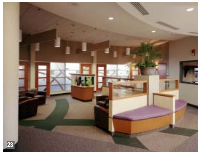
22 23 ER-7, Sinai Hospital of Baltimore University of California San Francisco Medical Center Baltimore, Maryland Architect: Anshen+Allen Architects, 1998