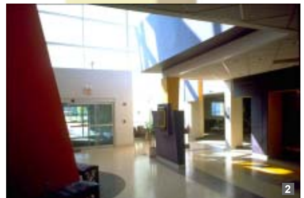
1 2 Kaiser Permanente, Townpark Clinic Kennesaw, Georgia Architect: Perkins & Will, 1998